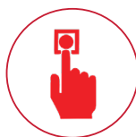
Emergency Shut Off Buttons