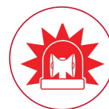
Horn & Strobe Lights