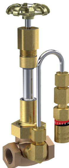
Valve with Integral SRV1