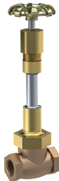
Bronze Cryogenic Globe Valve