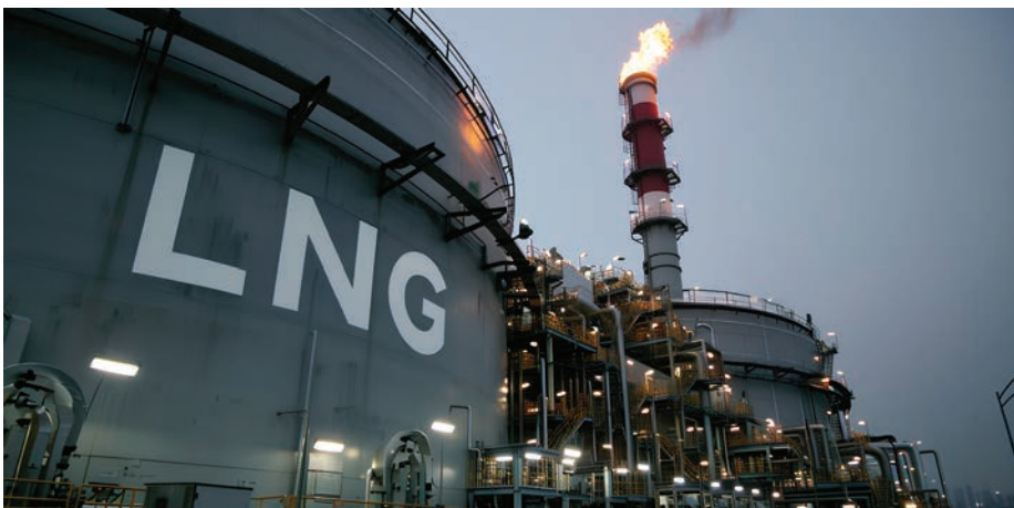
CryoWorks' LNG vacuum insulated and containment piping and components are used in a range of sectors

CryoWorks provides reliable piping systems and components in the transferring of LNG that is both safe and cost-effective. CryoWorks LNG Vacuum Insulated Dual Containment piping and components are generally designed for the life of the facility and satisfy strict safety requirements of PHMSA and NFPA 59A. In house engineering services accelerate the engineering phase of any LNG project helping to reduce the total project life cycle and mitigate potential delays to 1st LNG. CryoWorks products can be found across the entire value chain including liquefaction, bulk storage, peak shaving and bunkering.