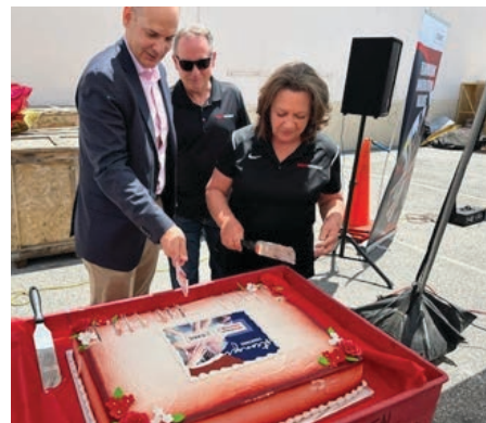
Crane welcomes CryoWorks

At the core of CryoWorks' success is its unwavering commitment to customer satisfaction and service. The company's customer-centric approach ensures that each client receives personalized attention and support throughout their project. From the initial consultation to post-installation services, CryoWorks is dedicated to delivering exceptional value and committed to exceeding customer expectations.