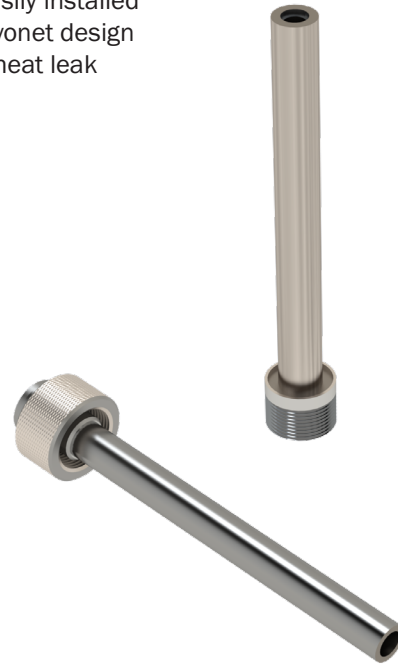
CB7 Series Tube Size