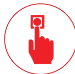
Emergency Shut Off Buttons