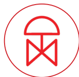
Emergency Shut Off Valves