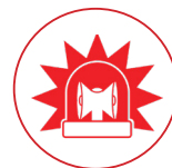
Horn & Strobe Lights