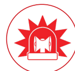
Horn & Strobe Lights